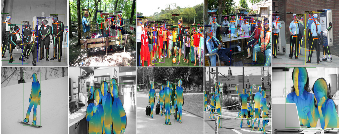
Figure 3. Qualitative results for keypoint detection (top row) and dense pose estimation (bottom row).

layer MLP with 4096 hidden units, ReLU, batch normalization, and an output dimension of 256. To create views, we follow Grill et al.’s [17] protocol.